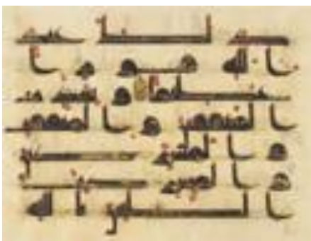
Early Kufic Script