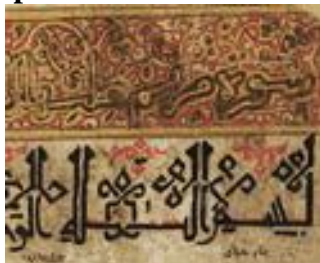
Plaited Eastern Kufic